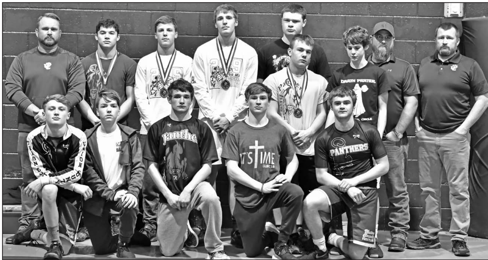
The Union County wrestling team following its appearance at the Area Tournament earlier this month. After sending four wrestlers to sectionals, three Panthers remain as the season comes to a head in Macon this weekend at the Class AA State Championships.